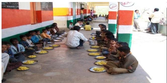
Table 5: Supervision of the performance of MDM in schools

The survey team has found more than half of the visited schools (i.e. 30 schools) were not inspected by any officials in last one year. It has been found that 26 schools in 40 villages have been visited by government officials in the last one year (2008 - 09).